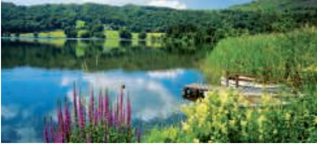
Experience the blue lakes, rolling green hills and tall peaks of the English Lake District.