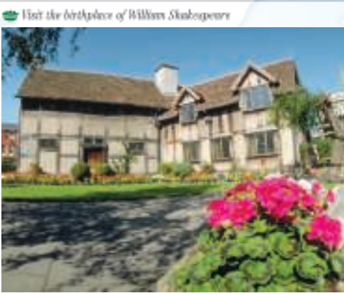
Visit the birthplace of William Shakespeare